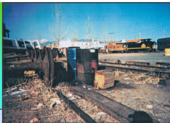
Santa Fe Railyard