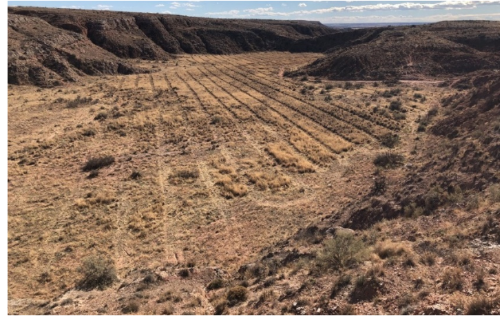
Roswell North Range MRS

The Proposed Remedial Action includes a surface clearance using hand-held analog geophysical sensors (metal detectors). Land use controls (a warning sign) will be installed at the MRS entrance since the subsurface will not be cleared of MEC. Lead-contaminated soil present within the sinkhole portion of the MRS will be excavated and disposed of off-site.