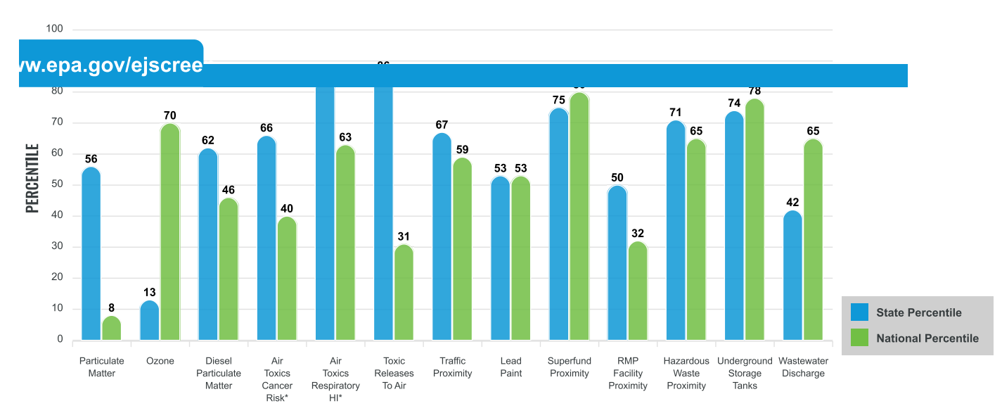
SUPPLEMENTAL INDEXES FOR THE SELECTED LOCATION

The supplemental indexes offer a different perspective on community-level vulnerability. They combine data on percent low-income, percent linguistically isolated, percent less than high school education, percent unemployed, and low life expectancy with a single environmental indicator.